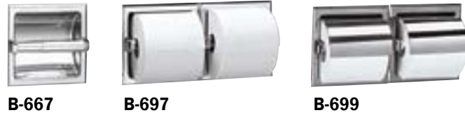
B-667 B-697 B-699