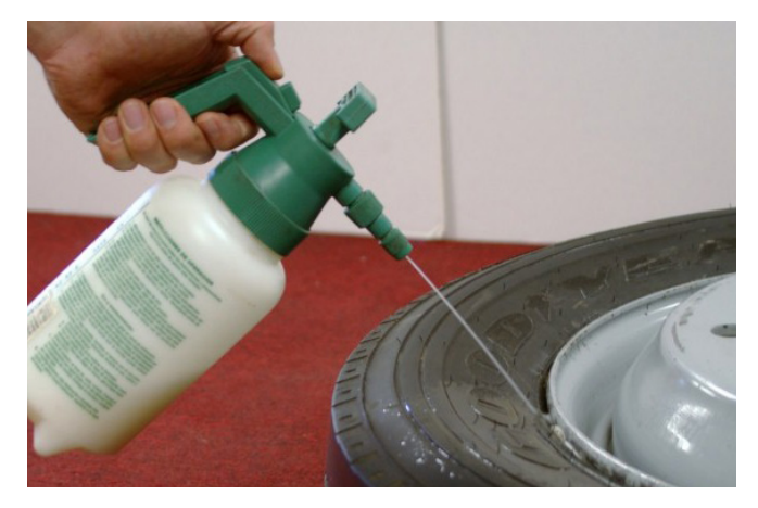
Generously lubricate both sides of the tire before demounting. NOTE: We recommend using liquid lubricant to penetrate between rim and tire bead for demounting.