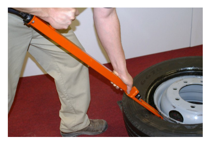
Place tool at an approximately 45 degree angle and insert between 2nd tire bead and rim.