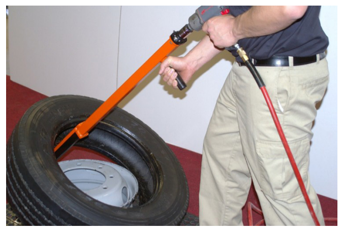
Continue to extend pushing foot with impact until tire is free of rim.

Begin to extend the push foot with an impact wrench in a counter clockwise motion. As the pushing foot begins to meet the rim, ensure that the plastic protective angle properly engages the rim edge and allow the natural motion of the tool to rock backwards.