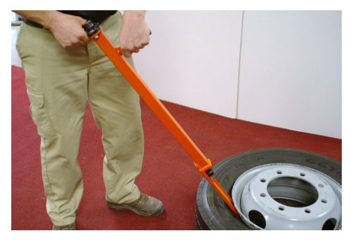
Bring tool to an upright position to engage the puller foot between rim and inside tire bead.