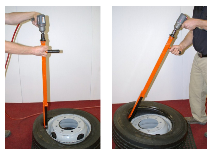
Continue to retract the pulling foot with the impact wrench while bringing the tool towards the wheel center in a pivoting motion until the 1st bead is removed. NOTE: Do not force or excessively pry with the tool. Allow the natural motion of the pulling foot to remove the tire.