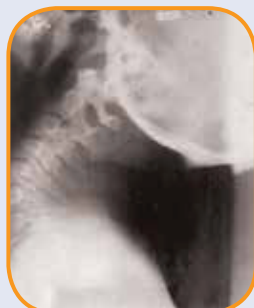
Without the UPGUARD