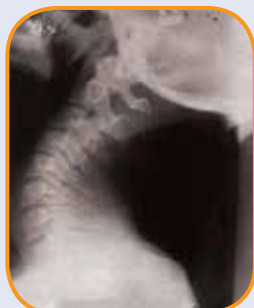
With the UPGUARD

Early X-Ray studies show what is occurring within many of the neck structures with the aid of the UPGUARD.