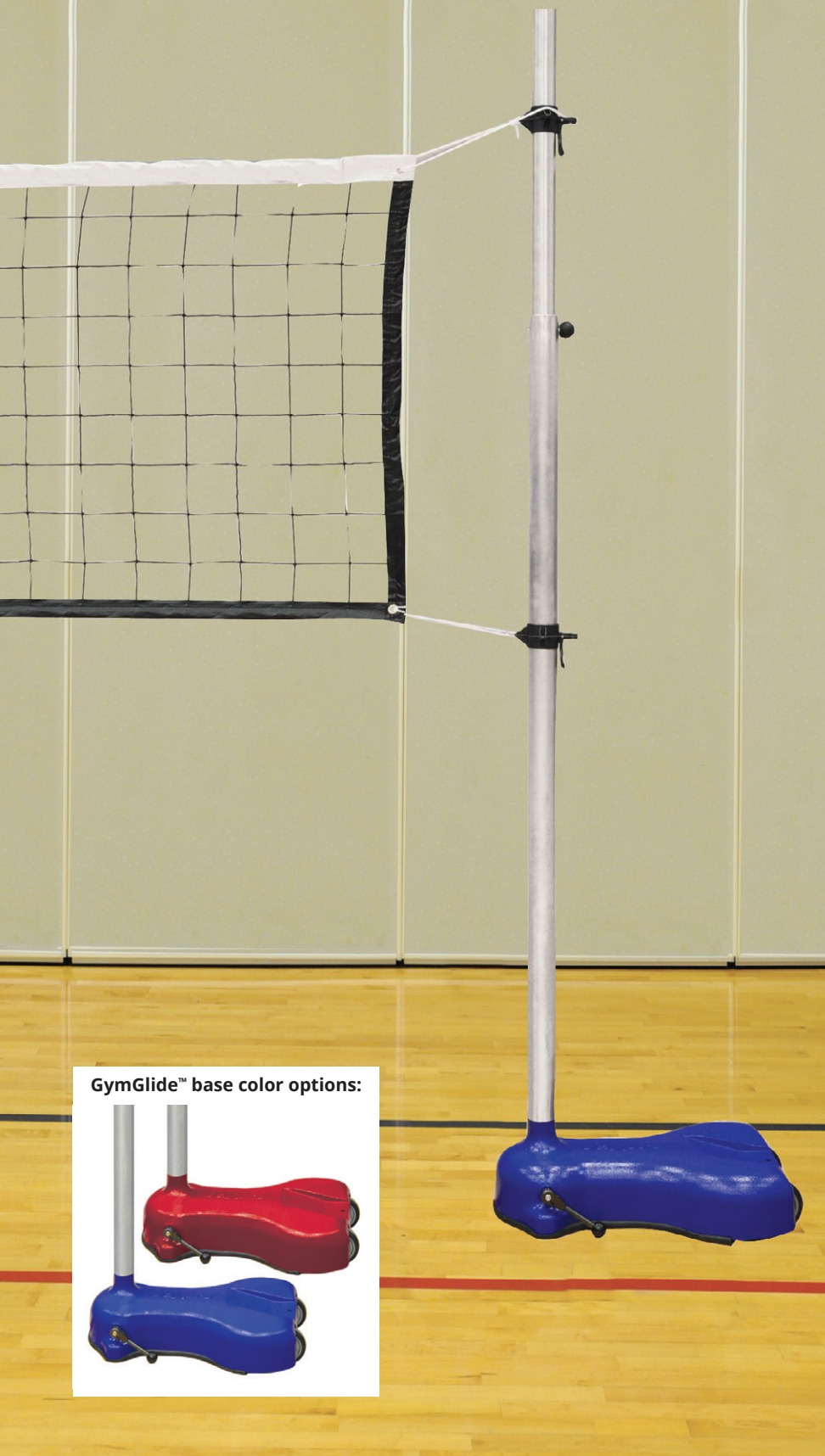
GymGlide™ base color options: