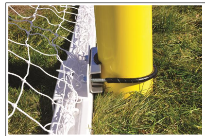
OPTIONAL SOCCER / FOOTBALL ANCHOR KIT