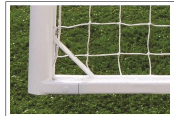
ADJUSTABLE REAR CROSSBAR