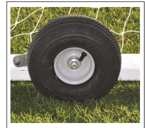
OPTIONAL WHEEL KIT