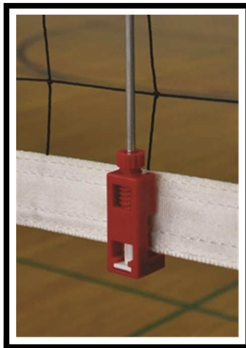
ADJUSTABLE CLAMP ON STYLE