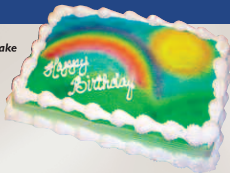
Food coloring on cake by: Julia Gawron

The Model 100 Series sprays properly reduced acrylics and pre-reduced materials such as inks, dyes, watercolors, gouaches, Air-Opaque™, Air-TeX® and MODELflex® airbrush colors.