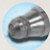
Reverse-a-guard air cap