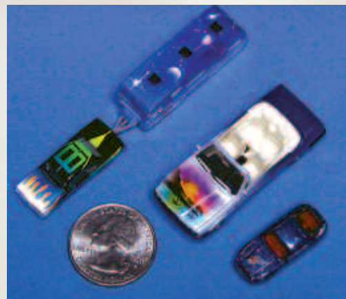
Miniature models by: Jorg Sellnow