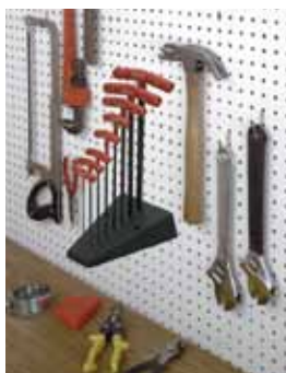
Set stand on bench or mount on wall.

Did you know...? Welded T-Handle handle/blade connection increases strength and provides greater resistance to breakage. The tool user will never be stabbed in the hand by a blade that has broken free and pushed through the handle.