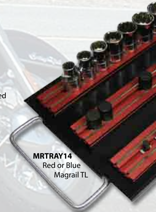
MRTRAY14 Red or Blue Magrail TL