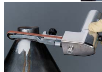
Slack of abrasive belt is used to efficiently polish radiused area.