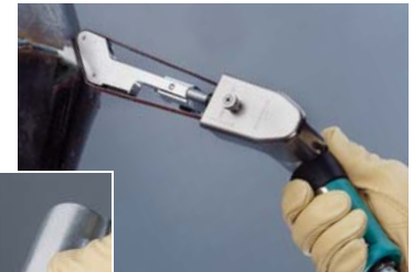
Optional 11200 Stroke Sander Arm leaves in-line scratch pattern.

Dynafile® II easily converts to a Die Grinder with optional 50010 Collet (1/4") or 50015 Collet (6 mm). To convert to a Drill, order 53032 Chuck (1/4").