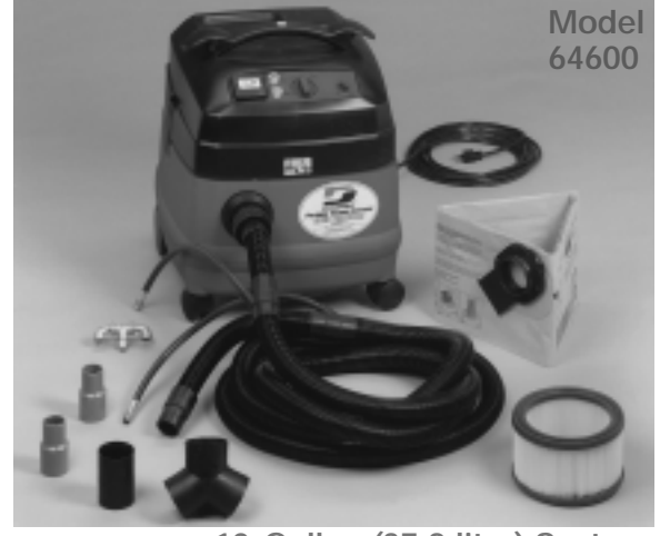
10-Gallon (37.8 liter) System Shown with standard and optional accessories.