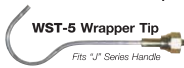
WST-5 Wrapper Tip Fits "J" Series Handle