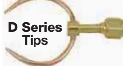
D Series Tips