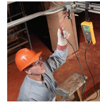
Magnetic Meter Hanger frees up both hands to focus on making measurements safely.

Check connections and motor windings with Lo ohms/earth-bond continuity test.