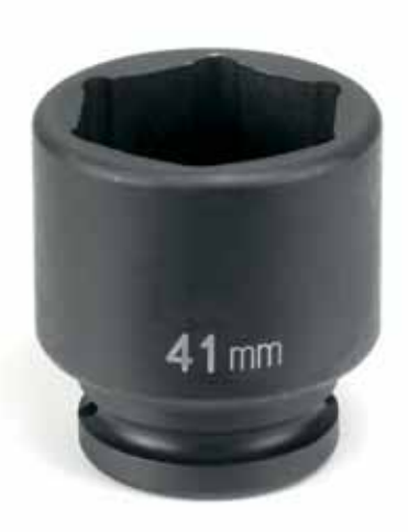
ANSI Specifications B107.2