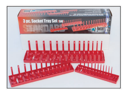
Part No. 9301 (RED) SAE Includes Part No. 1201, 3801, 1401

1/2" Drive, Regular and Deep Well • 3/8" Drive, Regular and Deep Well • 1/4" Drive, Regular and Deep Well