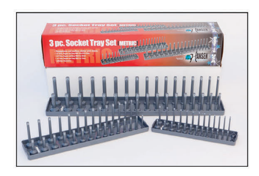
Part No. 9302 (GREY) Metric Includes Part No. 1202, 3802, 1402

Hansen Socket Trays straighten out toolbox clutter and chaos Socket Trays provide easy access and organization for individual sockets Post bases are beefed up and designed to hold socket more securely Made of tough ABS plastic that resists gas, oil and abuse Trilingual Packaging for SAE & Metric. 100% Made In The USA backed with a lifetime warranty.