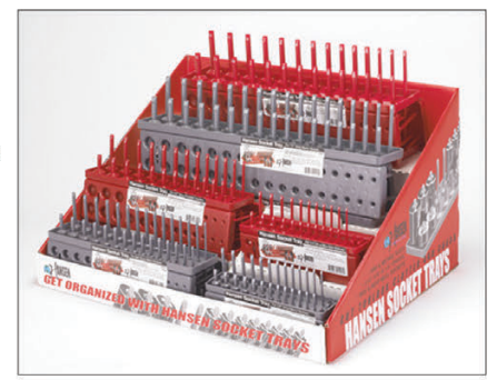
Part No. 9910

Display Socket Trays near the hand tools — display takes up just three square feet of shelf space — and watch 'em ring up sales! They practically sell themselves! You'll be showing and selling the industry's most popular toolbox accessory — Hansen Socket Trays. Socket trays come in SAE and Metric sizes for 1/2", 3/8" or 1/4" drives. They're molded of rugged ABS plastic to shrug off lubricants, solvents and abuse. Display holds four trays in each of the three SAE sizes and three Metric sizes. Part No. 9910 SAE Sizes, Red ABS • Metric Sizes, Gray ABS