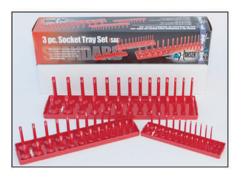
Part No. 9301 (RED) SAE Includes Part No. 1201, 3801, 1401

1/2" Drive, Regular and Deep Well • 3/8" Drive, Regular and Deep Well • 1/4" Drive, Regular and Deep Well