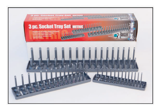
Part No. 9302 (GREY) Metric Includes Part No. 1202, 3802, 1402

Hansen Socket Trays straighten out toolbox clutter and chaos Socket Trays provide easy access and organization for individual sockets Post bases are beefed up and designed to hold socket more securely Made of tough ABS plastic that resists gas, oil and abuse Trilingual Packaging for SAE & Metric. 100% Made In The USA backed with a lifetime warranty.