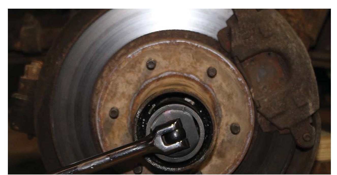
3246: 4WD Spindle Nut Wrench

Remove and install 4-slot front axle nuts on Ford F250-350, Bronco with Dana Axle, or Dana 50IFS or model 60 monobeam axle outer adjusting nut; GM Heavyduty 3/4- and 1-ton trucks