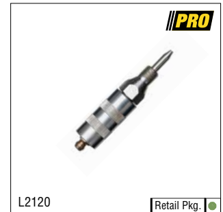
L2120 - Grease Coupler, Needle-Point, Short