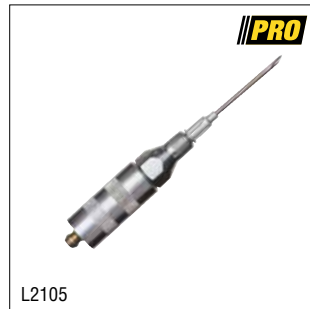
L2105 - Grease Coupler, Needle-Point, Hypodermic Type