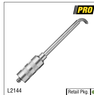
L2144 - Grease Coupler, 3 in. Needle-Point, Right Angle