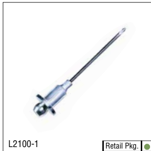
L2100-1 - Grease Coupler, Needle-Point, Hypodermic Type