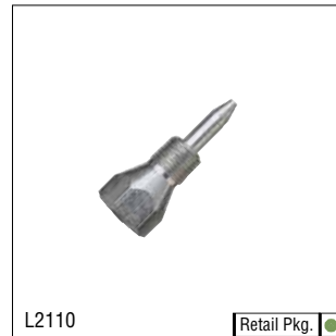
L2110 - Grease Coupler, Needle-Point, Straight Type