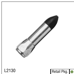
L2130 - Grease Coupler, Seal-Off/Rubber Tip