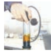
LEAK DETECTED (FLUID CHANGES TO YELLOW COLOR)