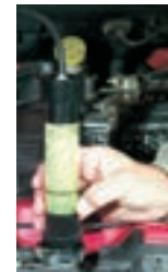
LEAK DETECTED (FLUID CHANGES TO YELLOW COLOR)