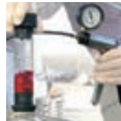
NO LEAK PRESENT (NO CHANGE IN FLUID COLOR)

75730 Combustion Leak Detector Fluid for Diesel. Shipping wt. 1 lb. 4 oz.