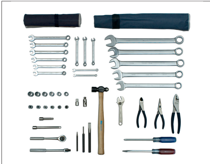
Tool Box Included - BX21