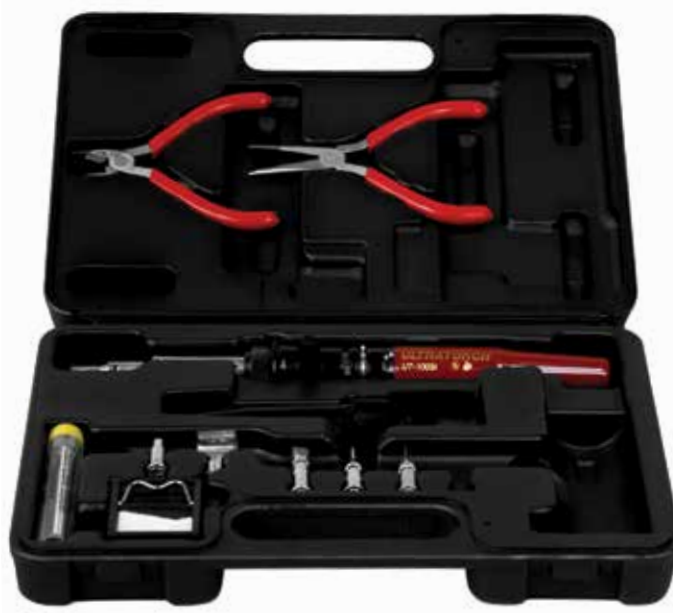
UT Series Ultratorch UT-100Si-TC

Ultratorch® UT-100Si, UT-100SiK & UT-100Si-TC