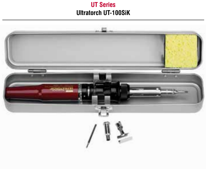
UT Series Ultratorch UT-100SiK

Includes heat tool, 3 soldering tips and flameless hot air tip, hot knife, solder, wire cutter, needle nose pliers and cap in a rugged storage/carrying case