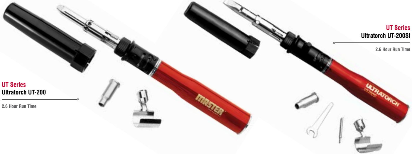
UT Series Ultratorch UT-200