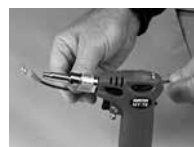
Flameless Hot Air