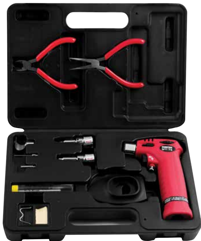
MT Series Triggertorch MT-76K

4 tools in 1 — Open Flame Torch, Soldering Iron, Flameless Hot Air and Hot Knife in a rugged storage/carrying case