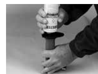
2 Hour Run Time