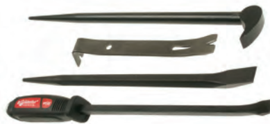
76295 – 4 Pc Utility Pry Bar Set