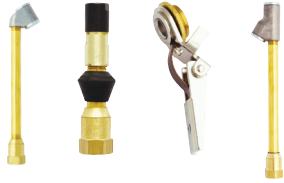
690 691 s-692 693

690 • 691 • 692 • 693 • 694 • 695 696 • 697 • 697-2 • 698 • 699