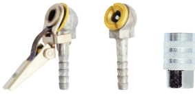
694 695 s-696