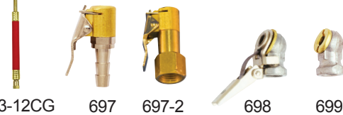
693-12CG 697 697-2 698 699