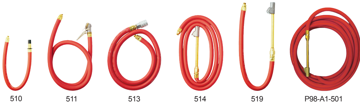
510 511 513 514 519 P98-A1-501