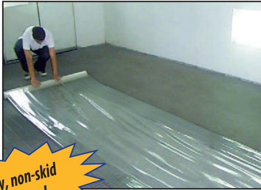
Unrolling "Clear" film onto booth floor.

Clear and White heavy-duty protective films keep floors clean.