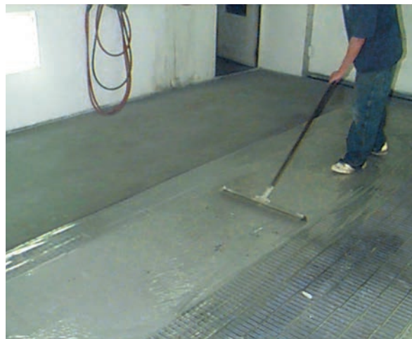
Film can be rinsed off and squeegeed.