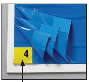
Position on concrete floor at entry to spray booth and on carpeted floor at entry to shop office. When the top MAT is dirty, peel back at corner to remove dirty MAT from PAD. A new, fresh MAT is now on top.