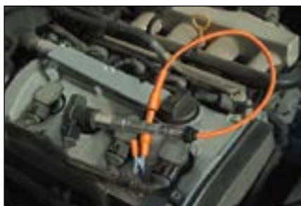
Test coil directly to ground