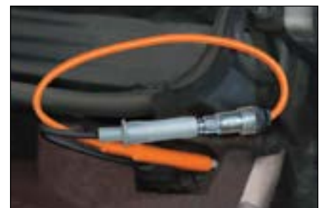
Test conventional ignition systems