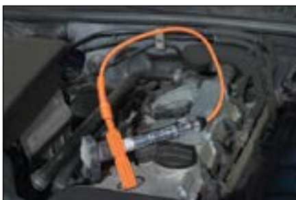
Test vehicles with recessed spark plugs