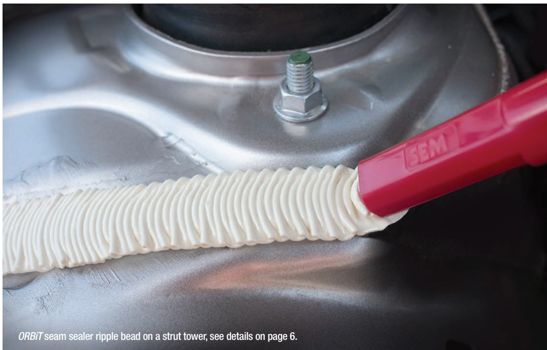
ORBIT seam sealer ripple bead on a strut tower, see details on page 6.