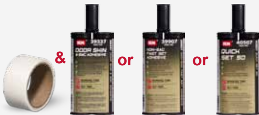
70006 PLASTIC REPAIR REINFORCING TAPE & 39337 DOOR SKIN & SMC ADHESIVE or 39907 NON-SAG FAST SET ADHESIVE or 4050( ) QUICK SET 50

Application Guns Available: 70019 1.7 OZ MANUAL APPLICATOR GUN 70039 UNIVERSAL PNEUMATIC APPLICATOR GUN 71119 UNIVERSAL MANUAL APPLICATOR GUN