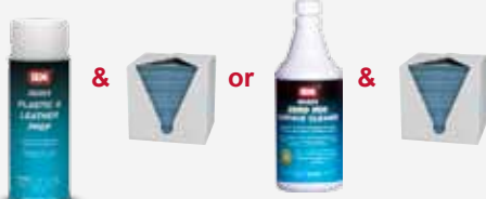
3835( ) PLASTIC & LEATHER PREP & lint free towels or 4040( ) ZERO VOC SURFACE CLEANER & gray scuff pads