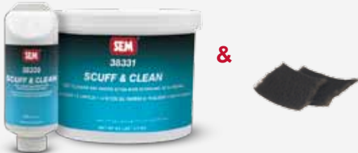
3833( ) SCUFF & CLEAN & gray scuff pads