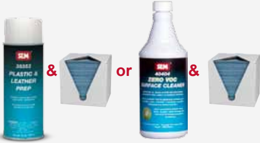
3835( ) PLASTIC & LEATHER PREP & lint free towels or 4040( ) ZERO VOC SURFACE CLEANER & lint free towels