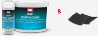
3833( ) SCUFF & CLEAN & gray scuff pads