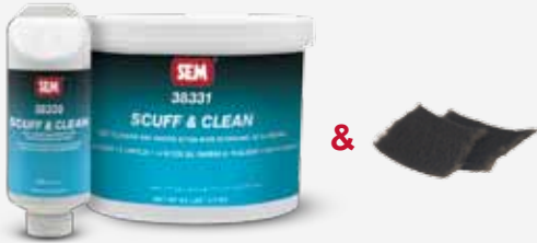
3833( ) SCUFF & CLEAN & gray scuff pads