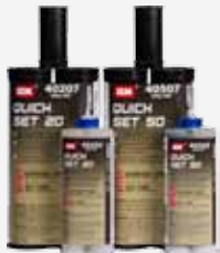
4020( ) QUICK SET 20 or 4050( ) QUICK SET 50