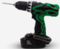
Drill with 1/8" bit