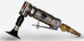
Grinder with 36-40 grit disc