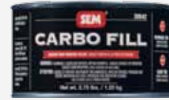
39542 CARBO FILL