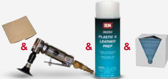
80 grit sand paper & a grinder with 36-40 grit disc & 3835( ) PLASTIC & LEATHER PREP & lint free towels