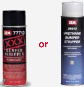
77713 XXX BUMPER STRIPPER or 39913 URETHANE BUMPER STRIPPER