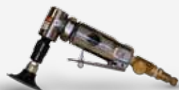
Grinder with 36-40 grit disc