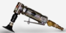
Grinder with 24 grit disc