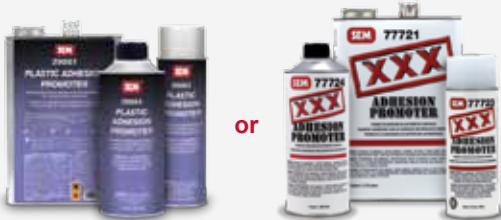
3986( ) PLASTIC ADHESION PROMOTER or 7772( ) XXX ADHESION PROMOTER