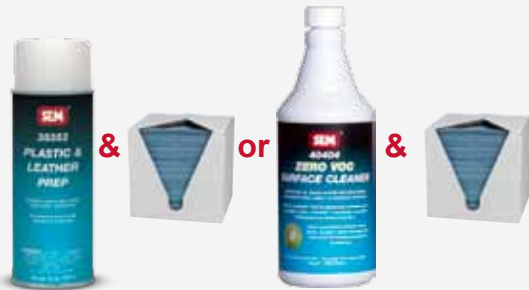
3835( ) PLASTIC & LEATHER PREP & lint free towels or 4040( ) ZERO VOC SURFACE CLEANER & lint free towels