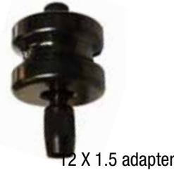
12 X 1.5 adapter

Developed for easy removal of injectors on all BMW's with direct injection. Simply screw the tool on to the top of the injector then, with 1 or 2 taps with slider, the injector will come out easily. This SP Tool is much more compact and easier to use than other injector pullers for BMW engines which greatly reduces the amount of time to replace injectors making more profit for technicians.