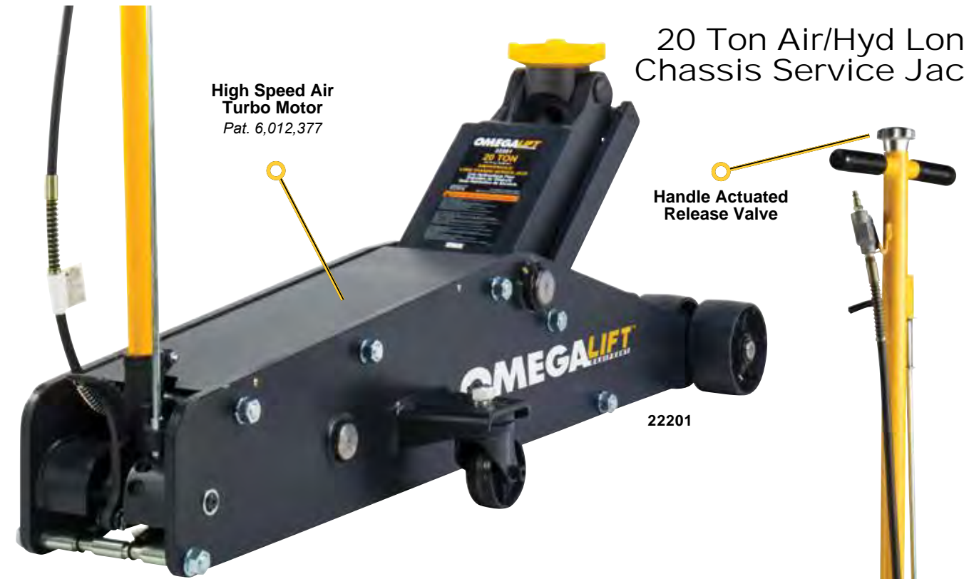
20 Ton Air/Hyd Long Chassis Service Jack