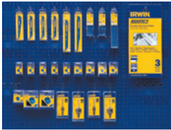
Includes Blue Wall