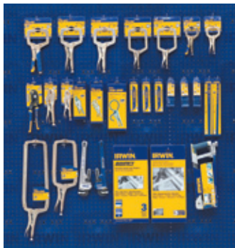
Includes Blue Wall