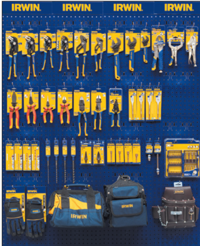
Includes Blue Wall