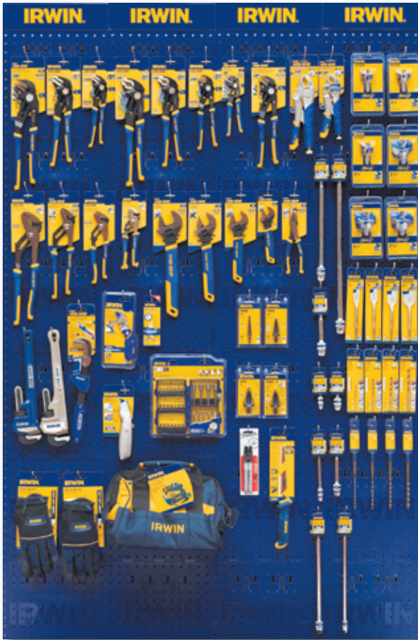
Includes Blue Wall