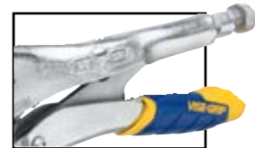
One-Hand Fast Release ™

The IRWIN VISE-GRIP Fast Release Locking Tool offers the strength and durability of The Original with the performance advantage of a release that is 2x easier to open. It unlocks from any angle without needing to press a trigger, making it ideal for professionals who work in tight spaces. The Fast Release Locking Tool also offers more finger room to accommodate large hands and professionals who wear gloves.