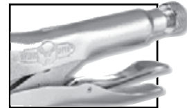
The Original SINCE 1924™

The Original IRWIN VISE-GRIP Locking Tools provide powerful locking force using the classic triggered design.