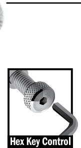
Hex Key Control