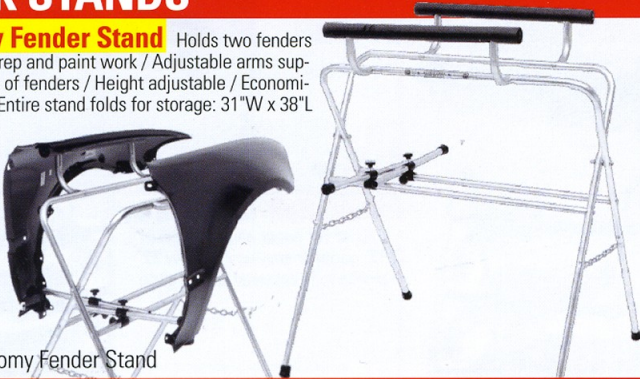
77786 Economy Fender Stand

Economy Fender Stand Holds two fenders securely for prep and paint work / Adjustable arms support the skirts of fenders / Height adjustable / Economically priced / Entire stand folds for storage: 31"W x 38"L x 45"H