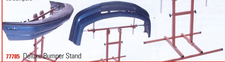
77785 Deluxe Bumper Stand

Complete bumper system includes support tubes, padded hoop & padded u-shaped brackets / Swivels 180° while holding the entire bumper securely / Adjusts up and down, in and out – works on the outside and inside of any bumper / Tubes extend to firmly hold "floppy ends" of plastic bumpers