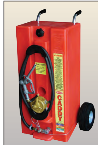
Shown with Standard Pump P/N 932403WP

NOTE: AN ELECTRIC PUMP CANNOT BE USED WITH A GAS OR EVACUATION CADDY.