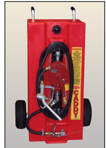
Shown with Industrial Pump P/N 932403IP