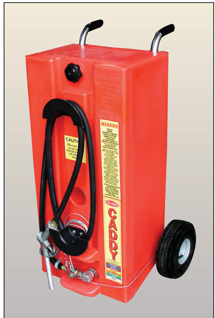
Shown with Gravity Feed P/N A93-2400

NEVER TRANSPORT CADDYS WITH A PUMP ATTACHED.