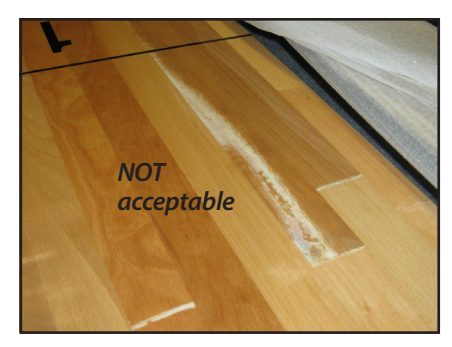
Play surface must be smooth and level with NO dips over 1/32" in depth and NO visible filler (see photo above).

All structural components to be CARB certified MDF