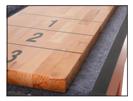
2.75" deep gutters are covered, bottom and sides, with grey, synthetic fiber, ribbed carpeting. Underside 2.125" deep