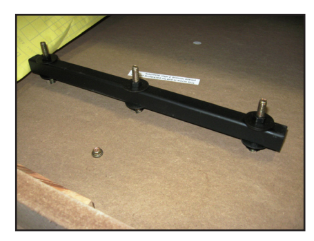
Securely fastened high quality black anodized steel Climate Adjusters, 13.5" x .75" square with 1/4" bolts and oversize washers. Five total approx. 36" apart.