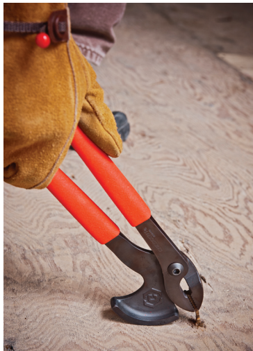
NP11 Nail Pulling Pliers

Dual handles make it quick and easy to grip, roll, and remove nails and staples.