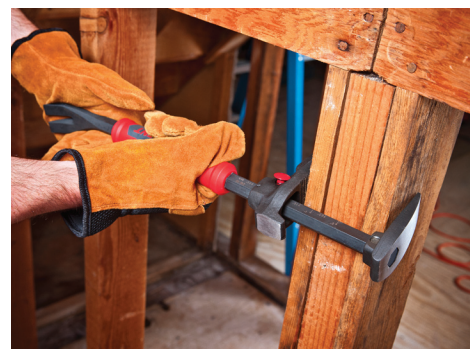
DB24 24" Adjustable Pry Bar

Jaws open up to 5-1/2 inches in 1/2-inch increments