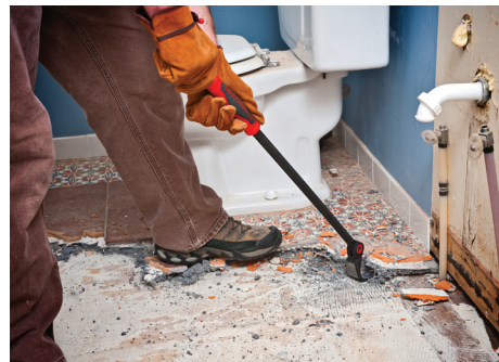
DB30X 30" Indexing Pry Bar

90-degree flat head offers better access and wider support for prying against surfaces