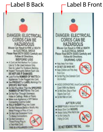
Label B is "Warning Label"