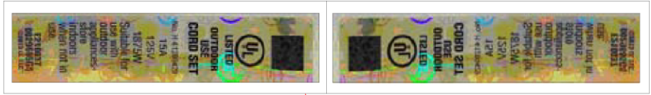
Label A is "UL Label"