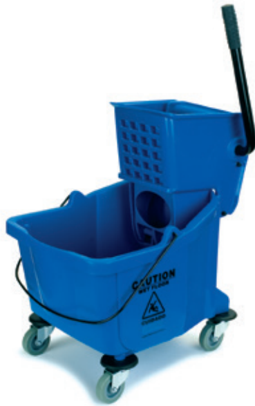
3690414 26/35 Quart Mop Bucket with Side Press Wringer