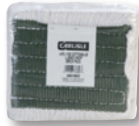
369418B00 4-Ply Cotton Mop with green wide headband and tailband, Medium (Brick Pack)