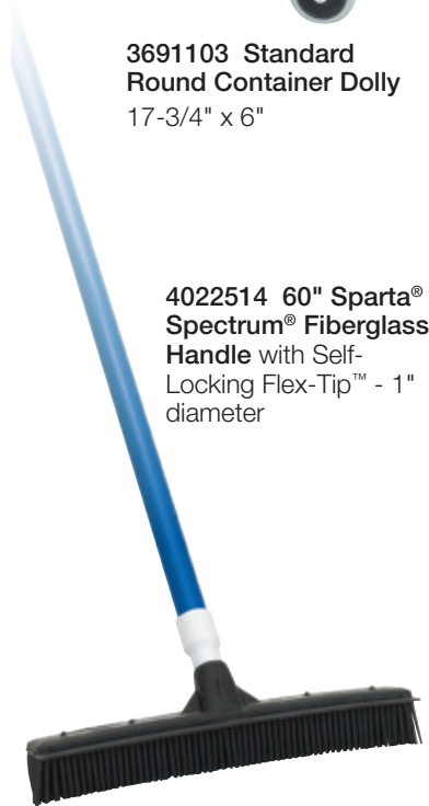
4022514 60" Sparta® Spectrum® Fiberglass Handle with Self-Locking Flex-Tip™ - 1" diameter