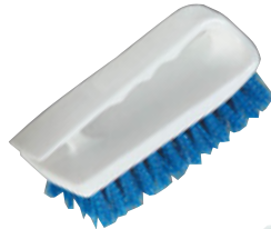
4002414 6" Iron Handle Hand Scrub with Polyester Bristles