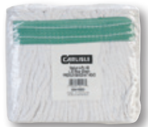
369419B00 4-Ply Cotton Mop with green narrow headband and tailband, Medium (Brick Pack)