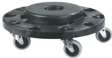
3691103 Standard Round Container Dolly 17-3/4" x 6"