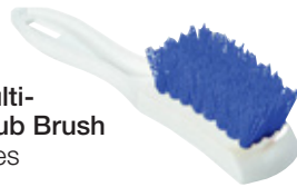
4139514 7-1/4" Multi-Purpose Hand Scrub Brush with Polyester Bristles