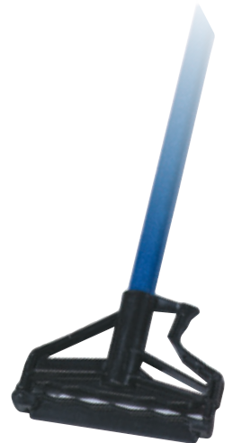
4166414 60" Quik-Release™ Fiberglass Mop Handle with 1" diameter