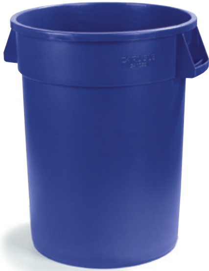
34103214 32 Gallon Waste Container