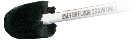
4014600 3" Floor Drain Brush and 4023600 36" Plastic Drain Brush Handle