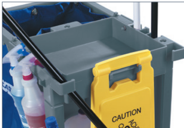
Front hooks hold most standard Wet Floor Signs. Built-in hanger holds multiple spray bottles.