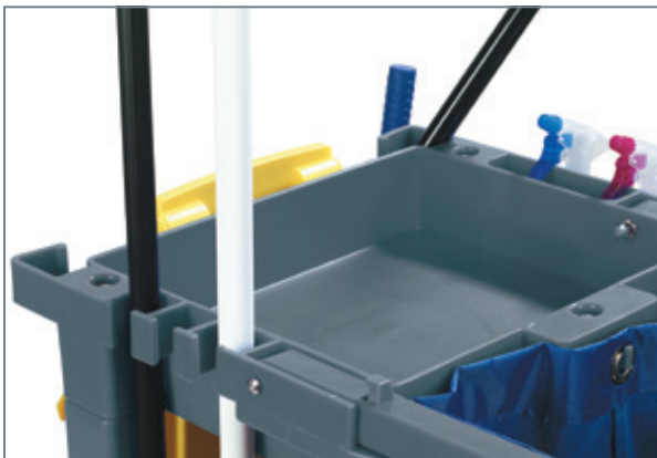
Integrated tool holders, shelves, and hooks keep everything organized including unwieldy handles.