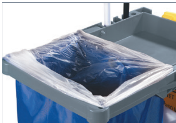
Tough 25 gallon nylon bag easily attaches to cart arm. Hooks on top of arm to hold trash liners in place. Arm swings up for more compact storage when not in use.