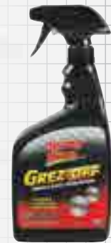
*Spray Nine® Brand products are not for sale in Canada through ITW Pro Brands