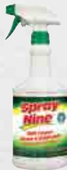
*Spray Nine® Brand products are not for sale in Canada through ITW Pro Brands