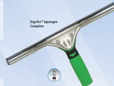
ErgoTec® Squeegee Complete