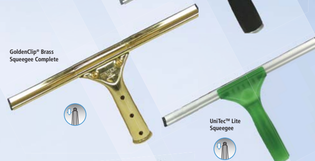
GoldenClip® Brass Squeegee Complete