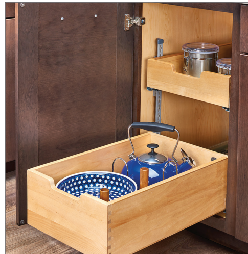
For pantries and base cabinets

Decorative Hardware Cabinet Hinges Aventos & Lifts Locks & Catches Doors & Drawers Slides Lighting Organizers Shelf & Closet Furniture Hardware Adhesives Lacquer & Finishes Abrasives Shop & Finishing Fasteners Tools Door Hardware