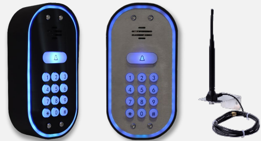
PRIME7-ARC-RBK-US (Black panel)

Stylish curved architectural model. Constructed from BS316 marine grade stainless steel and finished with gloss black acrylic trim. Blue backlighting.