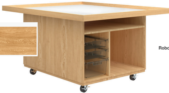
Robotic Mobile Workbench XW-4961K