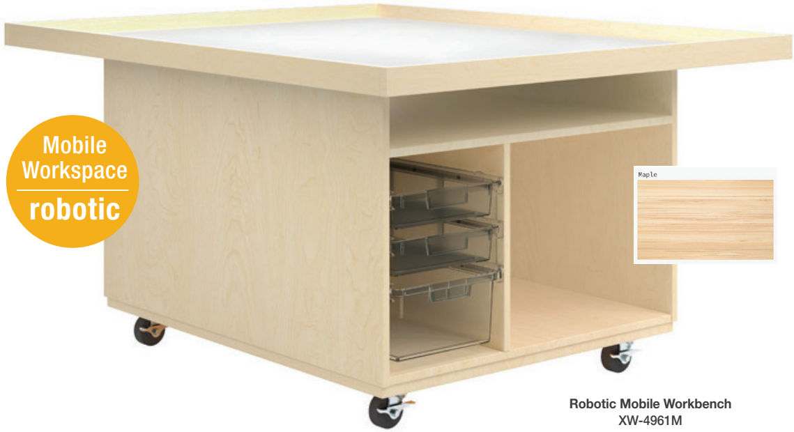
Robotic Mobile Workbench XW-4961M