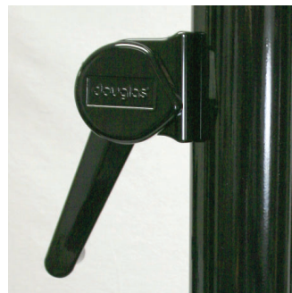
Deluxe Reel Side View