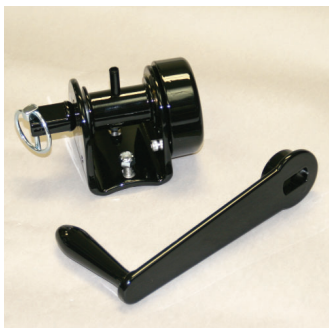
Aluminum Deluxe Reel